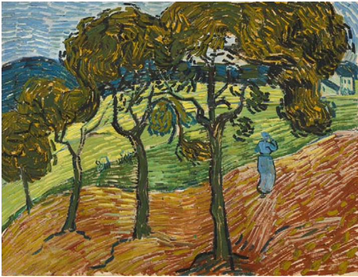
cone_10 - Vincent Van Gogh, Landscape with Figures , 1889, oil on canvas, The Baltimore Museum of Art: The Cone Collection, formed by Dr. Claribel Cone and Miss Etta Cone of Baltimore, Maryland, BMA