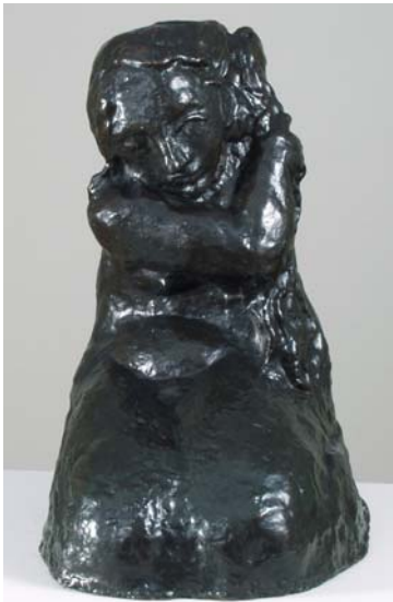
cone_13 - Pablo Picasso, Woman Plaiting Her Hair (Fernande) , original model 1906; this cast before 1940, bronze, The Baltimore Museum of Art: The Cone Collection, formed by Dr. Claribel Cone and Miss Etta Cone of Baltimore, Maryland, BMA © Picasso Estate / SODRAC, (2012)