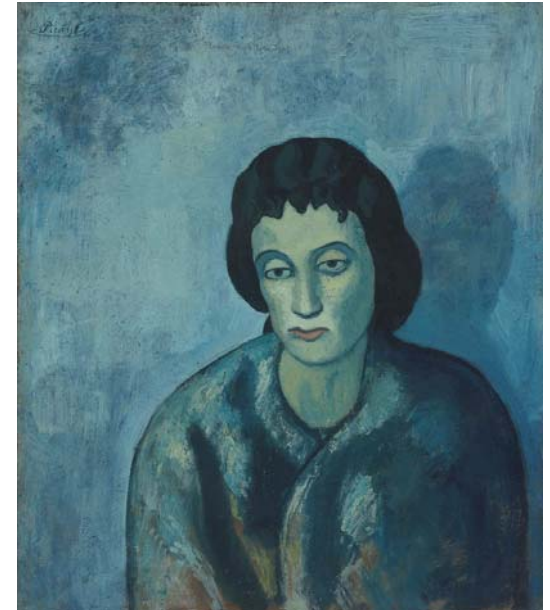
cone_09 - Pablo Picasso, Woman with Bangs , 1902, oil on canvas, The Baltimore Museum of Art: The Cone Collection, formed by Dr. Claribel Cone and Miss Etta Cone of Baltimore, Maryland, BMA. © Picasso Estate / SODRAC, (2012)