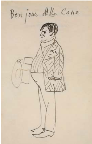
cone_05 - Pablo Picasso, Self-Portrait (Bonjour Mlle Cone) , 1907, pen and brown ink, The Baltimore Museum of Art: The Cone Collection, formed by Dr. Claribel Cone and Miss Etta Cone of Baltimore, Maryland, BMA © Picasso Estate / SODRAC, (2012)