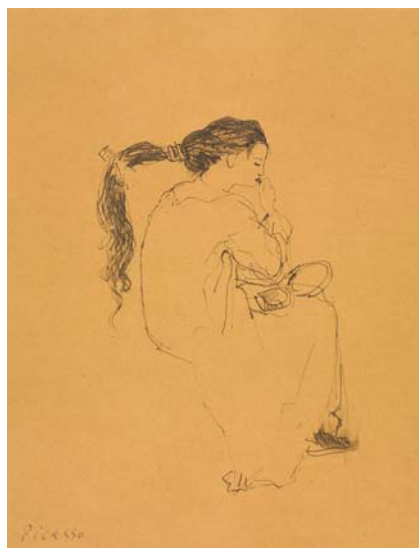
cone_04 - Pablo Picasso, La Coiffure , 1906, pen and brown ink with brush and brown wash, The Baltimore Museum of Art: The Cone Collection, formed by Dr. Claribel Cone and Miss Etta Cone of Baltimore, Maryland, BMA

PLEASE NOTE: Images may not be cropped or altered. In accordance with the Canadian Copyright Act, these images may only be reproduced for the purposes of criticism, review or news reporting in conjunction with the exhibition, and must be accompanied by the appropriate credit line, including all copyright and trademark symbols. The Vancouver Art Gallery will not be held liable for any unauthorized use of this material.