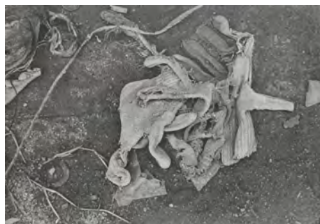
BOMBHEAD-06 Roy Kiyooka, Stonedgloves , 1970, silver gelatin print Collection of the Vancouver Art Gallery, Purchased with funds from the Vancouver Foundation and private donors