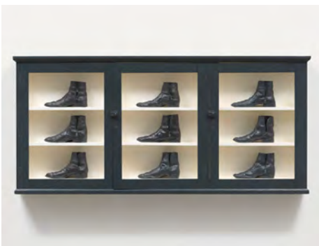
BOMBHEAD-05 Gathie Falk, Boot Case with Nine Black Shoes , c. 1973, earthenware Collection of the Vancouver Art Gallery, Vancouver Art Gallery Women's Auxiliary Gallery Shop Funds