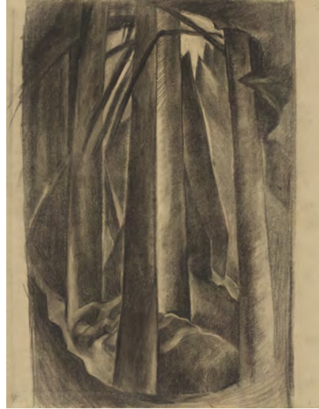
Emptiness-03 Emily Carr, Port Renfrew, 1929 charcoal on paper Collection of the Vancouver Art Gallery, Emily Carr Trust