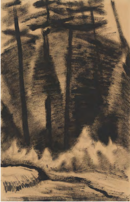
Emptiness-02 Emily Carr Untitled, 1931-32 charcoal, oil on paper Collection of the Vancouver Art Gallery, Emily Carr Trust