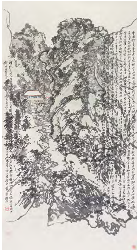
Emptiness-10 Lui Shou Kwan Landscape , 1972 ink, pigment on paper Private Collection