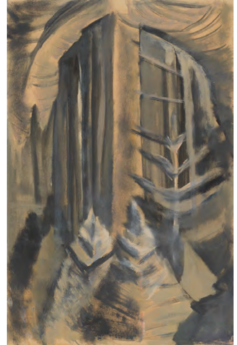
Emptiness-04 Emily Carr Untitled, 1931-32 charcoal, oil on paper Collection of the Vancouver Art Gallery, Emily Carr Trust