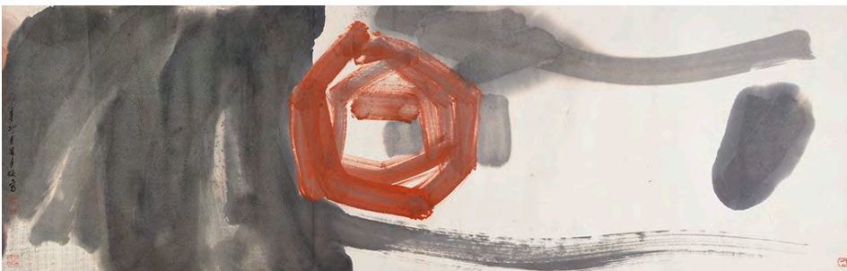
Emptiness-05 Lui Shou Kwan Zen Painting, 1951 ink, pigment on paper Private Collection