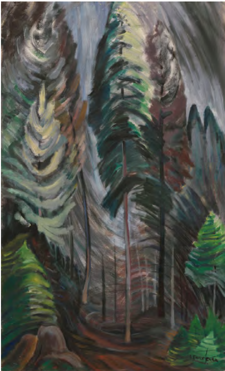
Emptiness-09 Emily Carr Among the Trees, 1936 oil on canvas Collection of the Vancouver Art Gallery, Emily Carr Trust