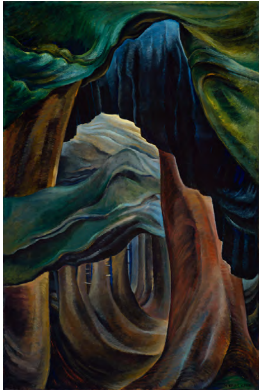
Emptiness-01 Emily Carr, Forest, British Columbia, 1931-32 oil on canvas, Collection of the Vancouver Art Gallery, Emily Carr Trust