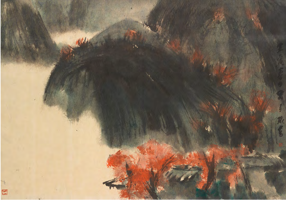
Emptiness-06 Lui Shou Kwan Untitled, 1962 ink, pigment on paper Private Collection