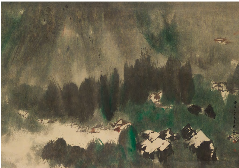
Emptiness-07 Lui Shou Kwan Untitled, 1961 ink, pigment on paper Private Collection