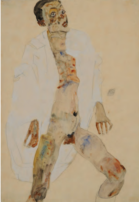
LivingBuilding-13 Egon Schiele Stehender Mann (Selbstbildnis) [Standing Man (Self Portrait)], 1911 watercolour and gouache over pencil on paper Levy Bequest Purchase, 1992 McMaster Museum of Art