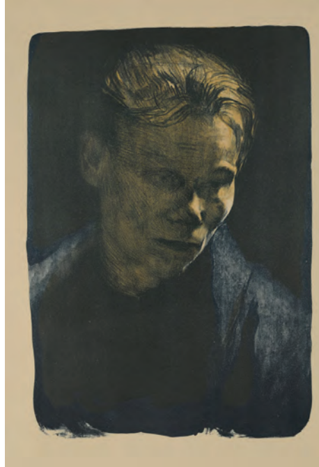
LivingBuilding-09 Käthe Kollwitz Brustbild einer Arbeiterfrau mit blauem Tuch [Bust of a Working Class Woman With a Blue Shawl], 1903 colour lithograph on sturdy tan wove paper