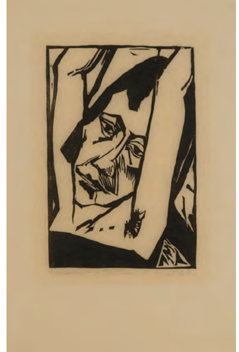
LivingBuilding-10 Erich Heckel Junges Mädchen [Young Woman], 1913 woodcut on silk Japan paper Gift of Undercliffe Limited, 1990 McMaster Museum of Art