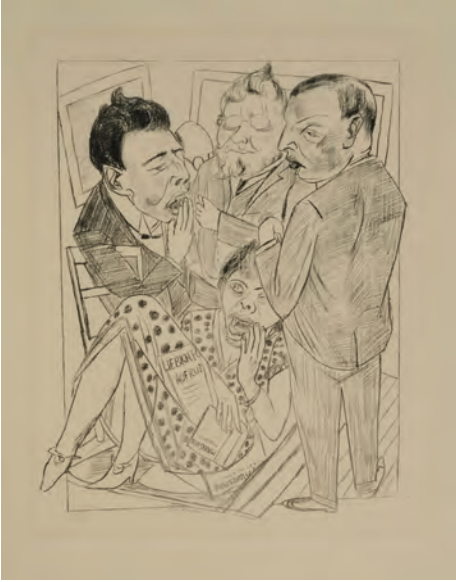
LivingBuilding-02 Max Beckmann Die Enttäuschten II [The Disappointed Ones], 1922 lithograph on paper Purchase, 1979 McMaster Museum of Art