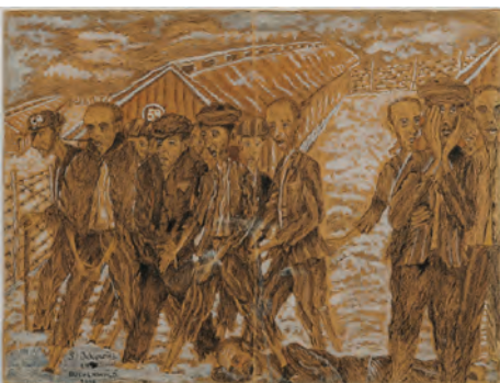
LivingBuilding-11 Gershon Iskowitz Buchenwald , 1944-45 watercolour and ink on paper mounted on cardboard Levy Bequest Purchase, 1993 McMaster Museum of Art © The Gershon Iskowitz Foundation