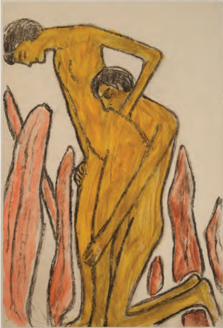
LivingBuilding-08 Christian Rohlf Paar , 1910-11 watercolour and charcoal on paper Donald Murray Shepherd Trust Purchase, 2011 McMaster Museum of Art