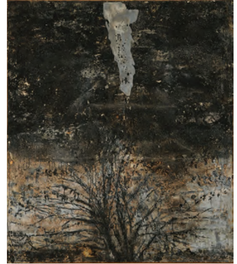
LivingBuilding-04 Anselm Kiefer Yggdrasil , 1985–91 emulsion, acrylic (partially charred) and melted lead on canvas Levy Bequest Purchase, 1993 McMaster Museum of Art © Anselm Kiefer