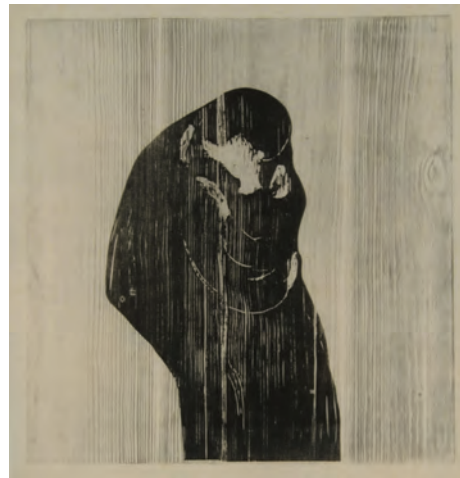
LivingBuilding-06 Edvard Munch Der Kuss [The Kiss], 1897–1902 woodcut from two blocks on tissue-thin Japan paper Levy Bequest Purchase, 1993 McMaster Museum of Art