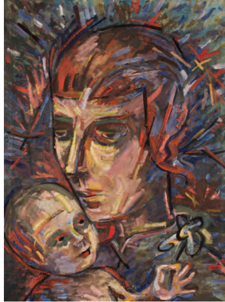
LivingBuilding-14 Hannah Hoch Mutter und Kind (Selbstbildnis Traum) [Mother and Child (Self portrait Dream)], c. 1931 oil on cotton canvas Donald Murray Shepherd Trust Purchase, 2013 McMaster Museum of Art © Estate of Hannah Höch/SODRAC (2018)