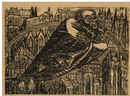
LivingBuilding-12 Ernst Barlach Die Dome [The Cathedrals], from the portfolio Die Wandlungen Gottes [The Transformations of God] 1920-21, printed 1922 woodcut on paper Gift of Janet Black, 1997 McMaster Museum of Art