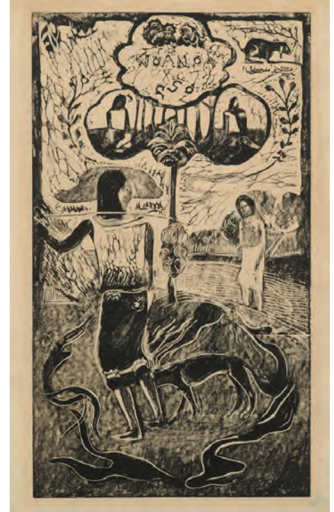
LivingBuilding-15 Paul Gauguin Noa Noa. Embaumé Embaumé. [Fragrant Scent], 1893–94 woodcut on pale cream Japan paper Levy Bequest Purchase, 1995 McMaster Museum of Art