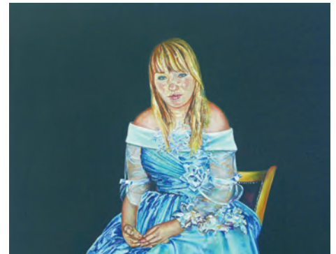
LivingBuilding-07 Natalka Husar Commissar's Daughter , 2007 oil on rag board Gift of the Artist, 2011 McMaster Museum of Art © Natalka Husar